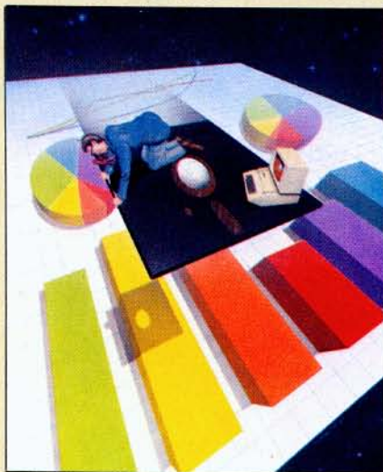
cover art by Jonathan Graves